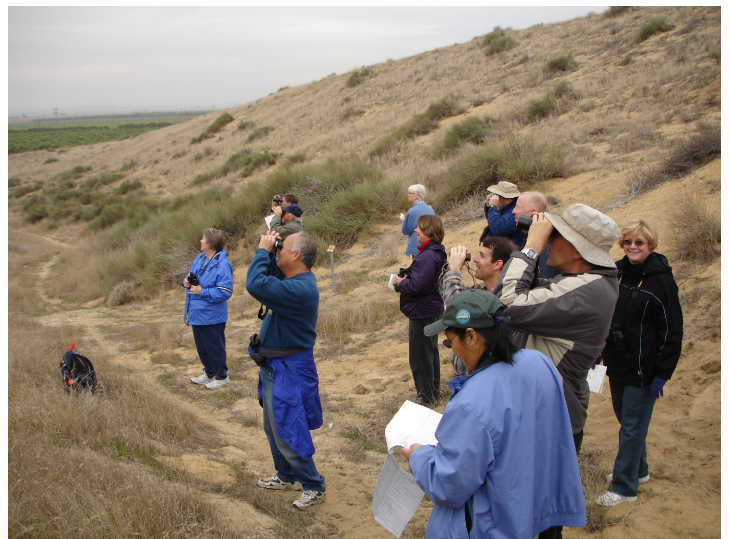
Sand Ridge Nature Preserve Field Trip February 2007