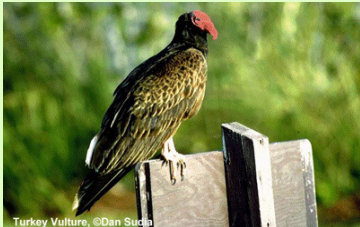
Turkey Vulture