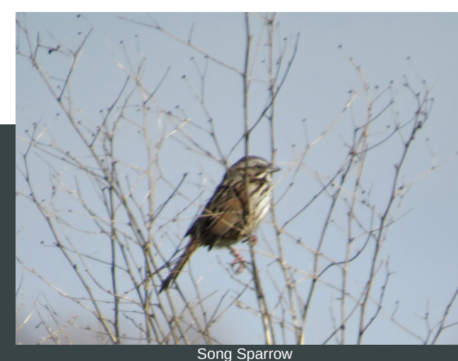
Song Sparrow San Luis National Wildlife Refuge March 10, 2019.