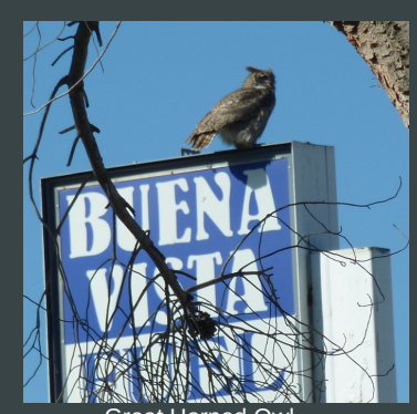
Buena Vista Lake, Kern County, CA. March 2019.