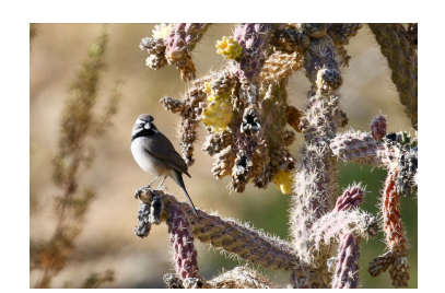
Black-Throated Sparrow Galileo Hill October 24, 2019.