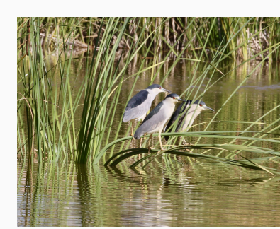
Black-Crowned Night Herons Galileo Hill Field Trip October 5, 2019.