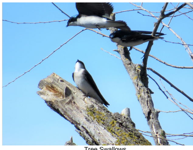
Tree Swallows San Luis National Wildlife Refuge March 10, 2019.