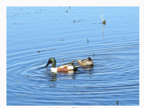
Nothern Shoveler Merced National Wildlife Refuge March 11, 2019.