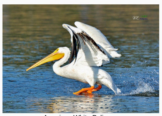
American White Pelican. Basin Wildlife Reserve in Los Angeles, CA. January 11, 2018.