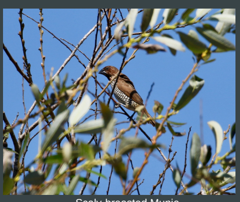
Scaly-breasted Munia Laguna Lake near San Luis Obispo September 25, 2019