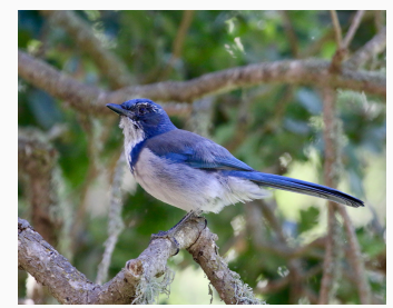
California Scrub Jay Los Alamos Park near Santa Maria, CA. September 26th, 2019.