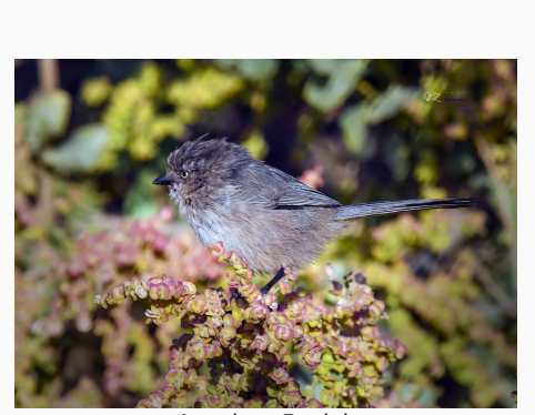
American Bushtit Malibu Lagoon in Los Angeles, CA. October 12, 2018.