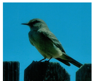
Ash-Throated Flycatcher NW Bakersfield near Olive & Calloway Spring, 2019.