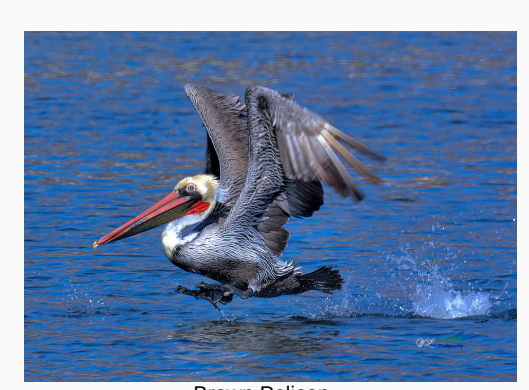
Brown Pelican Malibu Lagoon in Los Angeles, CA. January 11, 2018.