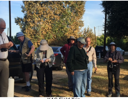
KAS Field Trip Hart Park in Kern County, CA. September 2019.