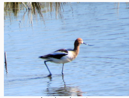
American Avocet Merced National Wildlife Refuge March 11, 2019.