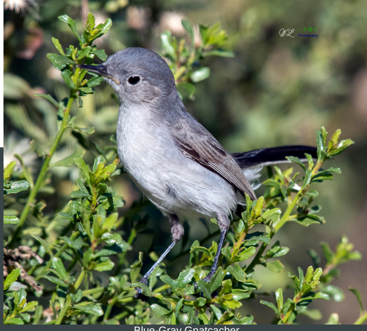
Blue-Gray Gnatcacher Basin Wildlife Reserve in Los Angeles, CA. December 21, 2018.