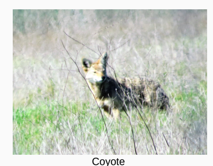
San Luis National Wildlife Refuge March 10, 2019.

Have copies of your Audubon magazine? We need them to give to students at science camp. Bring them to any monthly meeting.