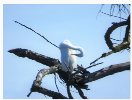
Great Egret San Luis National Wildlife Refuge March 10, 2019.