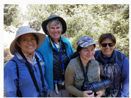
KAS - Tehachapi Outing in Stallion Springs, CA. October 2019.