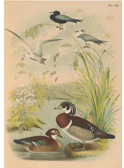
Wood Duck plate from 1903 "Birds of North America"

There is still time to get your ticket for an amazing antique book, "Birds of North America" by Jacob Henry Studer. We will be drawing the winning ticket at our June picnic. Don't miss this opportunity to own a 1903 edition of a beautiful piece of bird history. It has been restored and has a value of up to $500. Tickets are $5 or 3 for $10. It contains 119 full-page chromolithographic plates in rich vibrant colors showing over 700 birds. The plates were reproduced from drawings by Theodore Jasper and appeared in the original 1878 edition. Proceeds will benefit our favorite friends, birds. Questions or tickets, call Kevin Fahey at 706-7459 or you can purchase ticket(s) at the picnic!