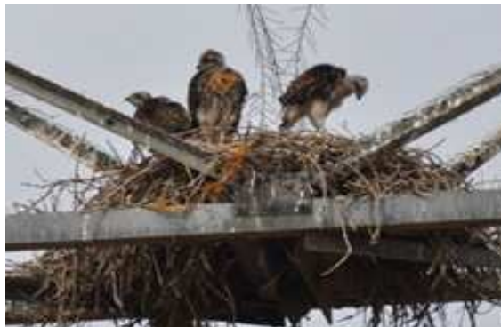
3 fledgling Red-tailed Hawks at Panorama Vista Preserve