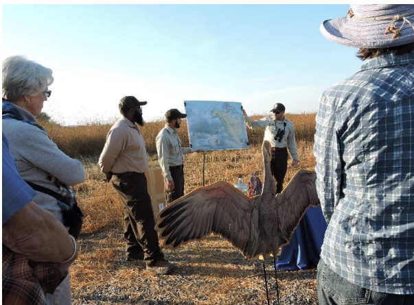
Above: Kern & Pixley National Wildlife Refuge staff talk about Sandhill Crane migration during the recent "Return of the Cranes" event, attended by over 50 engaged birders. Visit the cranes this

Participants are typically assigned to teams based on their bird identification skill level and endurance. The count results are tabulated by National Audubon and Cornell Lab of Ornithology. Help is needed on many of these counts, so find one that interests you and contact the compiler for more information. (New birders are paired with veterans, so you don't have to be an expert.) Too cold to come out on a cold day? How about keeping a list of birds that you see in your yard on that day (be a "feeder watcher"), or you can join a team to cover a territory